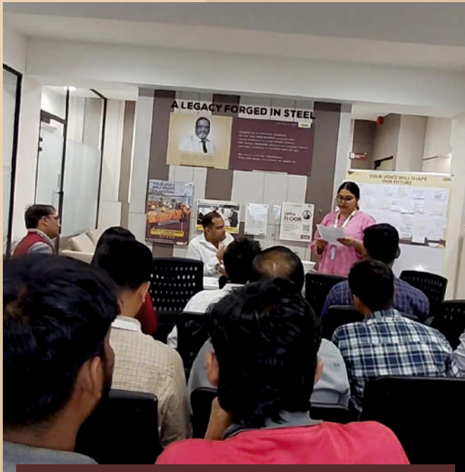
Open floor discussion

Suggestion & Feedback Week | FEBRUARY 2026