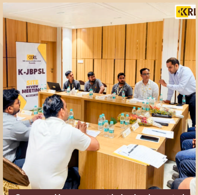
On-ground improvement being implemented