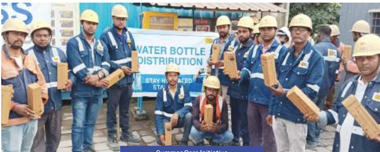
Summer Care Initiative