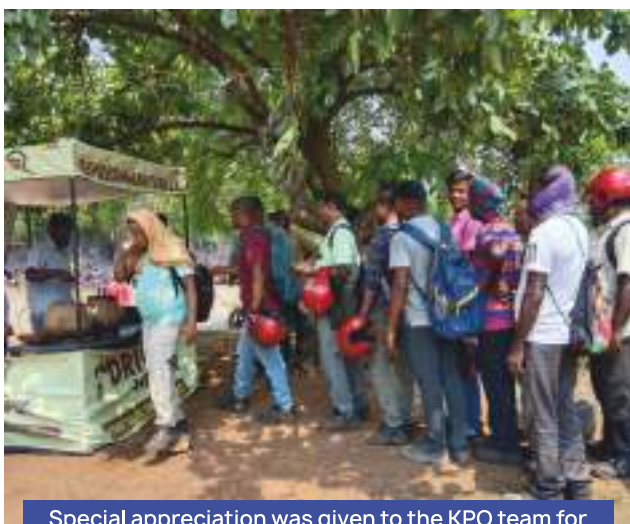
Special appreciation was given to the KPO team for the timely planning, coordination, and successful execution of all May initiative activities